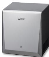
Jet Towel Smart Silver JT-SIAP-S-NA