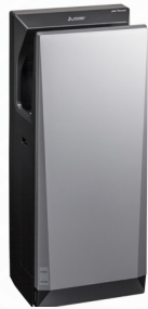
Jet Towel Slim Gray JT-SB116 JH2-S-NA