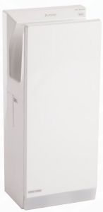
Jet Towel Slim White JT-SB116JH-W-NA

The Jet Towel puts 20 years of Mitsubishi innovation to work for you in 10 seconds at 235 mph. It's simply a smarter solution. When you compare the costs and advantages of the Jet Towel, you'll see why it's time to throw away the paper towel for good.