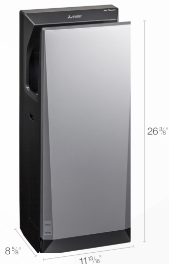
JT-SB116 JH2-S-NA (Silver) JT-SB116 JH-W-NA (White)