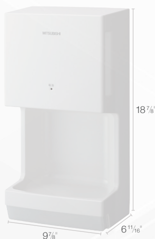
JT-MC106 G-W-NA (White)