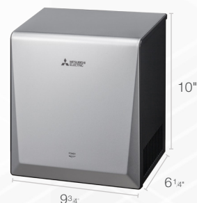
JT-SIAP-S-NA (Silver) JT-SIAP-W-NA (White)