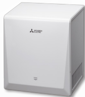
Jet Towel Smart White JT-SIAP-W-NA